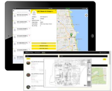
Life-Saving Accessible Record Field Inspectors/First Response

This mobile application enables field access to view all key site data related to a structure by a geo-location . Your inspectors can do more in a day, and that improves community safety .