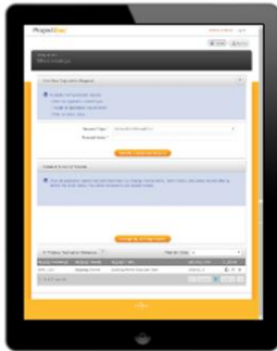
Applicant Submission Applicants/Developers

This web application simplifies submitting permit and plan review applications via a jurisdiction's web site. OAS provides easy online account registrations and profile management that applicants love .