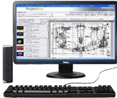
ePlan Review/Approval Plan Examiners

Jurisdictions gain dramatic efficiency in building plan approvals, thereby creating jobs and revenues faster - all while servicing citizens better and assuring building safety .